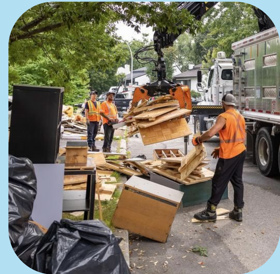
City of Laval workers cleanup on one of Laval's residential streets following the devastating recent floods.