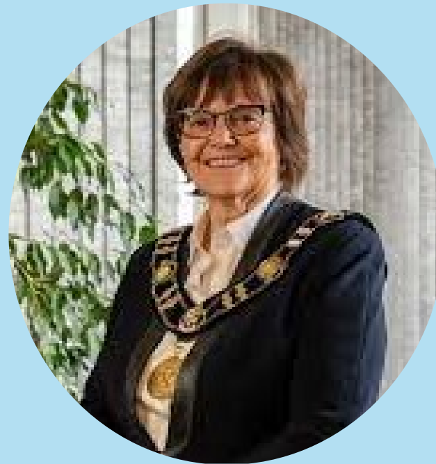
MAYOR SANDRA EASTON Lincoln