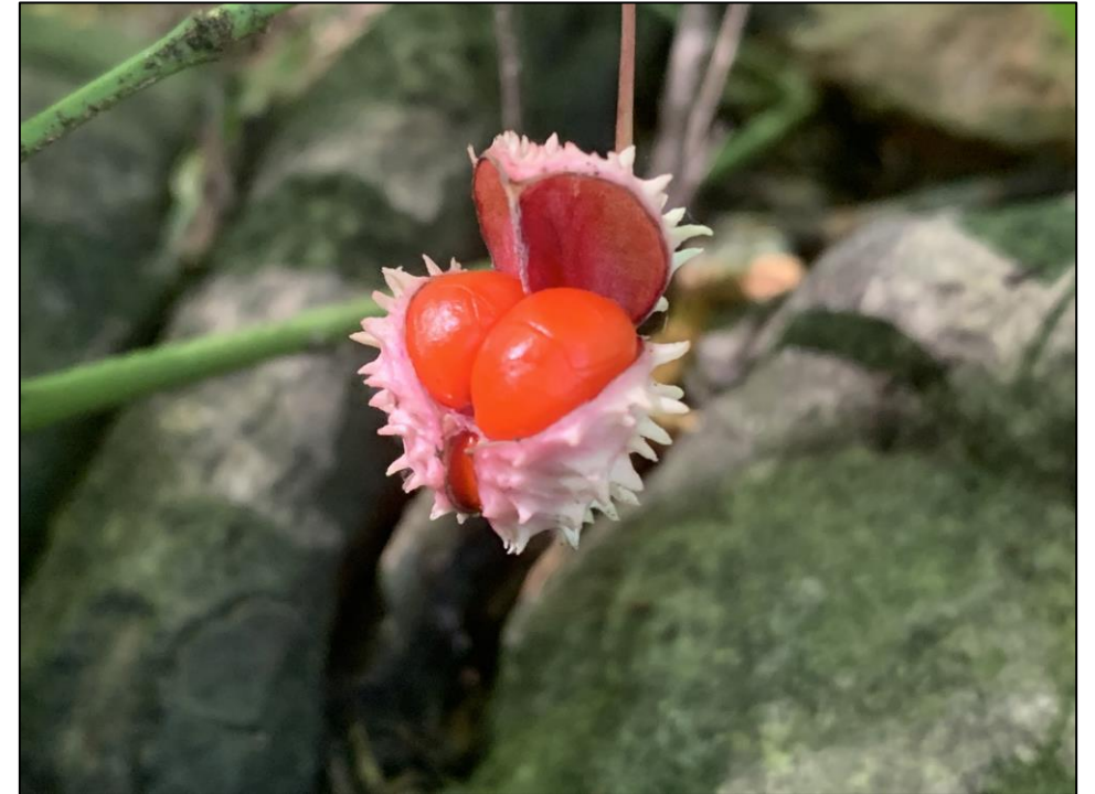
Running Strawberry Bush