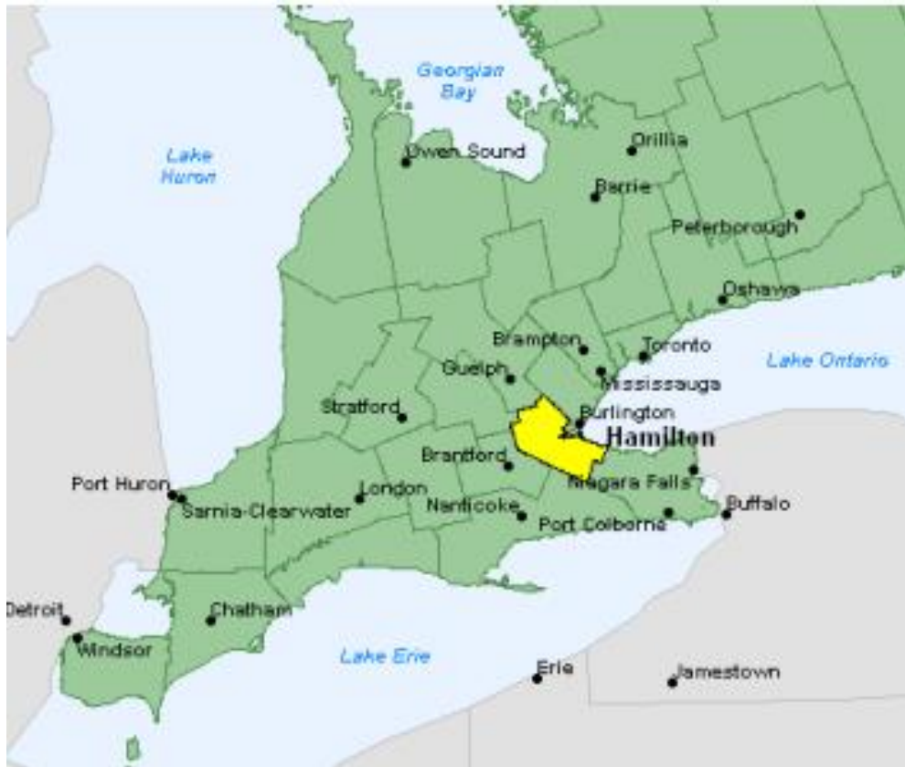
Hamilton, Ontario (World Map)