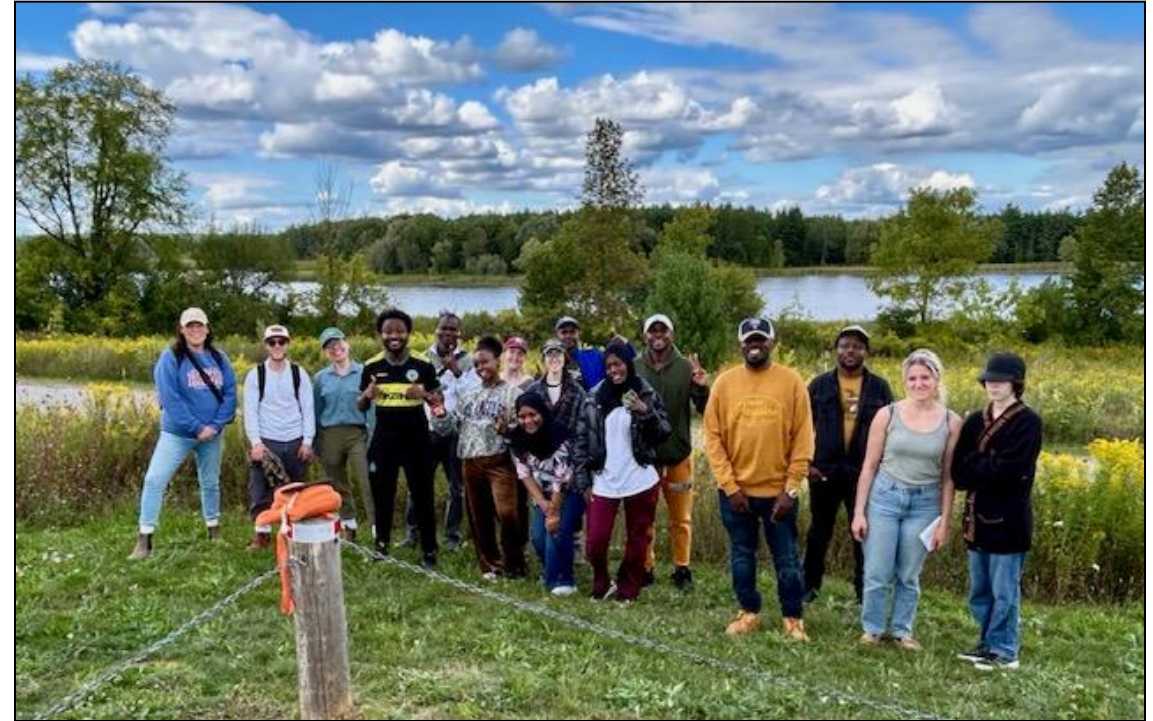
Invasive Species Workshop