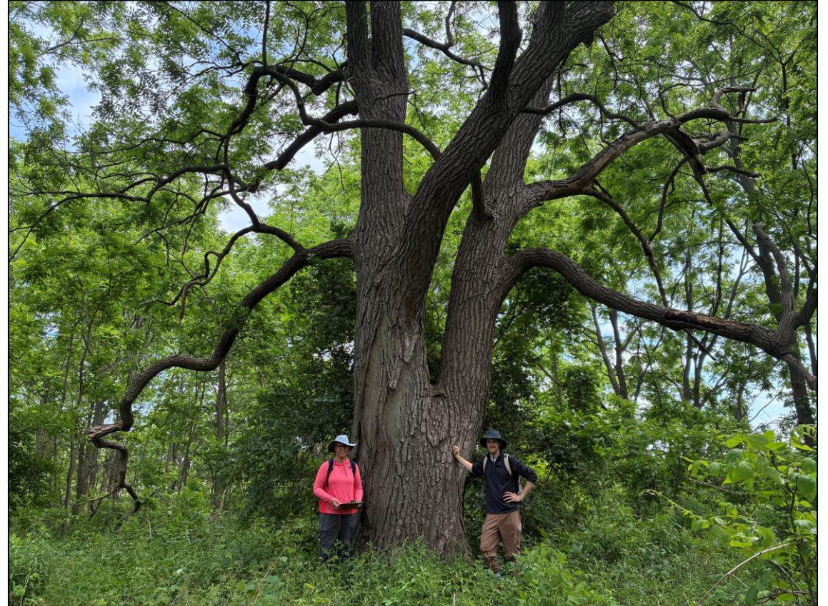
ELC crew, Sherry and Spencer, with a Black Walnut