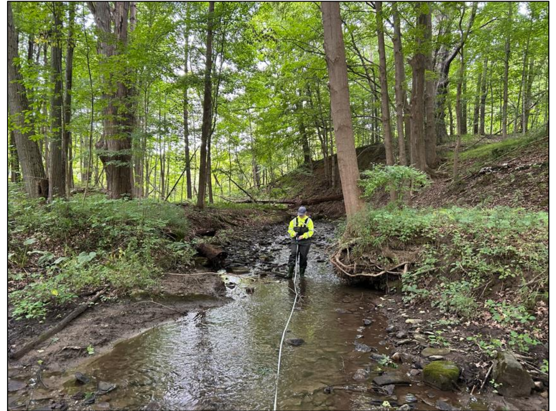
Aquatic Field Technician, Emilia, sampling a stream