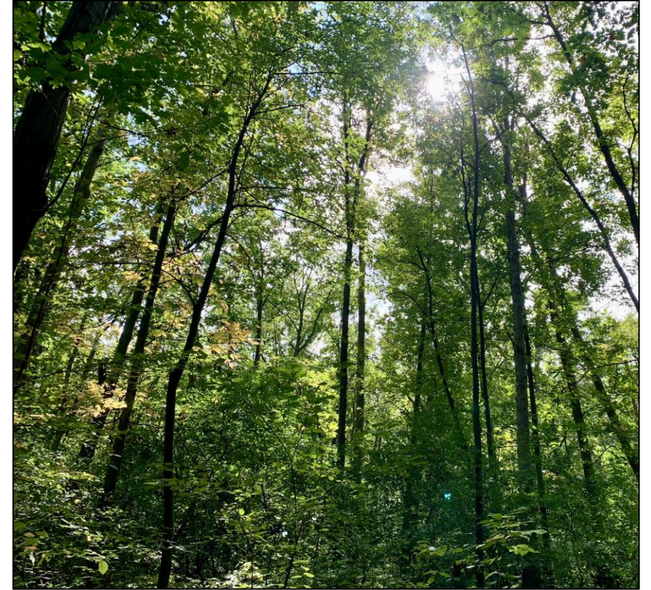
An Urban Woodlot